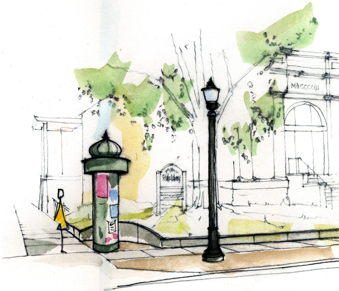
sketch of kiosk within design parameters specified