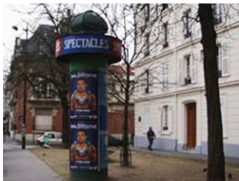
traditional urban kiosk example