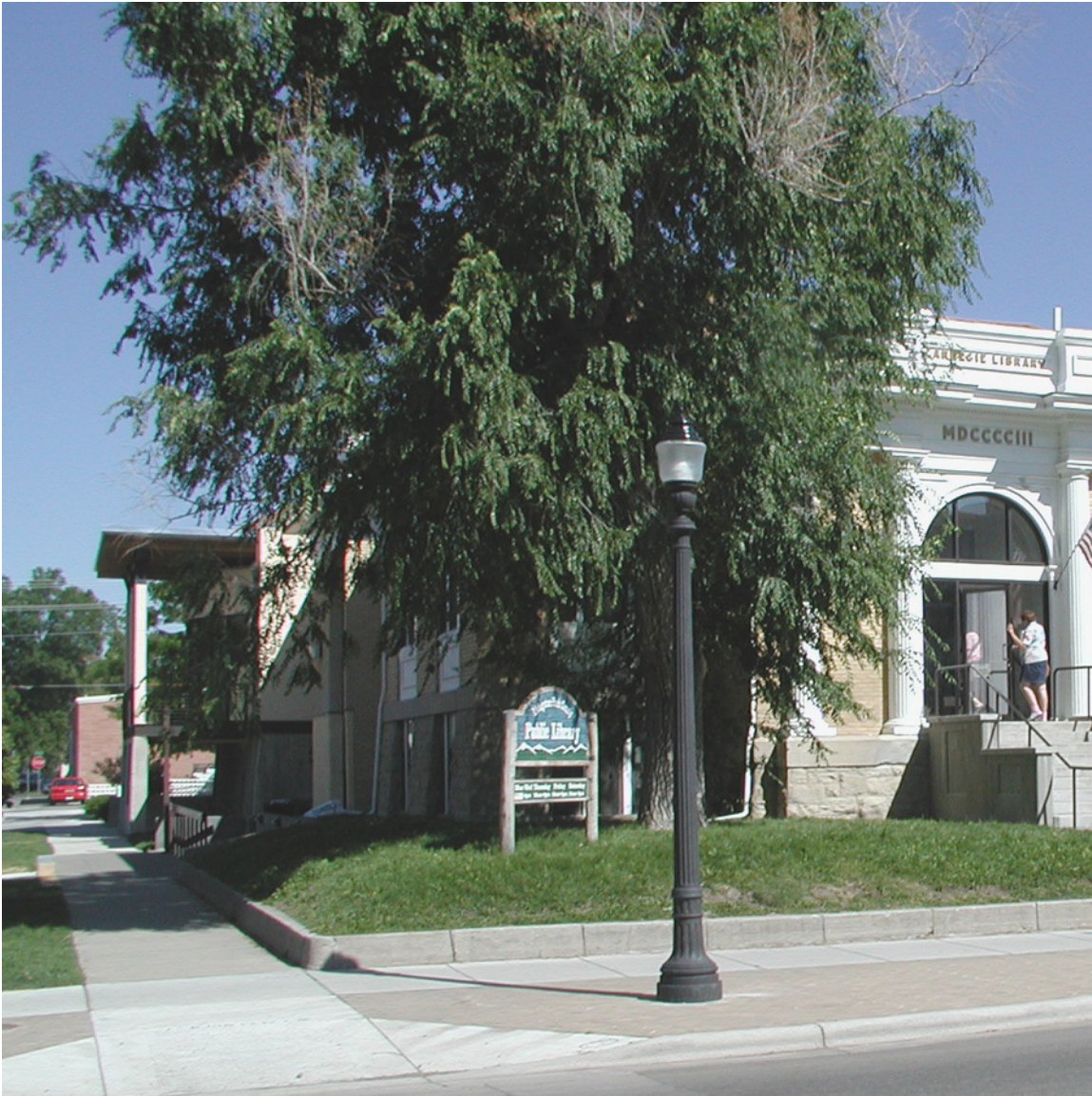
photograph of existing Library property corner